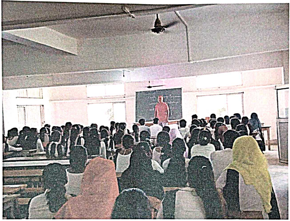
Faculty Exchange Programme with West-Goalpara College, Ambasi on — 15-12-2022